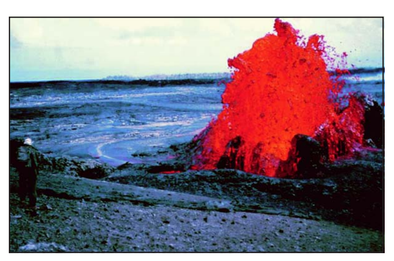
Figure 1. 1993 lava fountain, Kilauea Volcano, Hawaii.

Lava from the AD 1901 eruption of Hualalei in Hawaii has potassium-argon (K-Ar) ages as great as 1.1 billion years. Historic eruptions of Mt. Kilauea in Hawaii (Fig. 1) have produced submarine lavas with K-