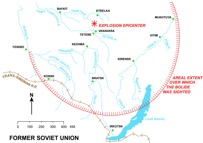
FIGURE 1. Area map of the 1908 Tunguska explosion event. After Sullivan 1979.

... the peasants saw a body shining very brightly (too bright for the naked eye) with a bluish-white light....The body was in the form of 'a pipe', i.e. cylindrical. The sky was cloudless, except that low