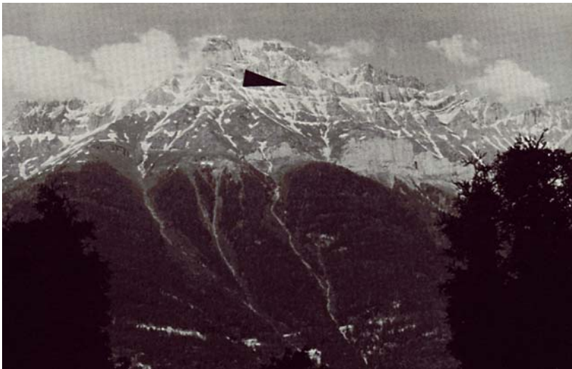
FIGURE 8. Valley of the Rhône in Switzerland. The arrow points to an assumed 35 Ma or more gap in sedimentation.

An additional point of interest related to this question is the fact that present rates of erosion on the earth are so rapid that many of the layers between the gaps should have been eroded away many times during the assumed long time period represented by the missing layers. Present rates of erosion for the United States average about 6.1 cm/1000 yrs (Judson & Ritter 1964), which is 61 m/Ma. In 10 Ma one would expect 600 m of erosion, etc. It is sometimes stated that our present rates of erosion should level the United States in 10 Ma or less.