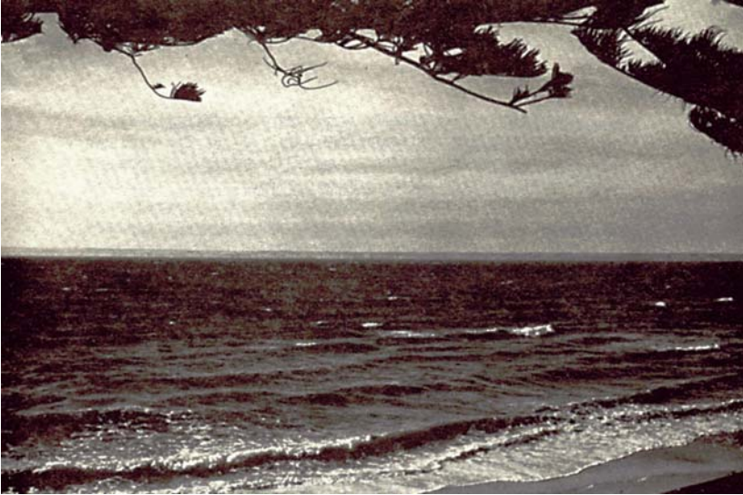
FIGURE 9. View of part of Kangaroo Island, South Australia. Across the bay the general flatness of this island can be seen. The surface of this island is assumed to be some 200 Ma old.

Even if it is accepted that estimates of the contemporary rate of degradation of land surfaces are several orders too high (Dole and Stabler, 1909; Judson and Ritter, 1964; see also Gilluly, 1955; Menard, 1961) to provide an accurate yardstick of erosion in the geological past there has surely been ample time for the very ancient features preserved in the present landscape to have been eradicated several times over. Yet the silcreted land surface of central Australia has survived perhaps 20 m.y. of weathering and erosion under varied climatic conditions, as has the laterite surface of the northern areas of the continent. The laterite surface of the Gulfs region of South Australia is even more remarkable, for it has persisted through some 200 m.y. of epigene [surface] attack. The forms preserved on the granite residuals of Eyre Peninsula have likewise withstood long periods of exposure and yet remain recognizably the landforms that developed under weathering attack many millions of years ago.