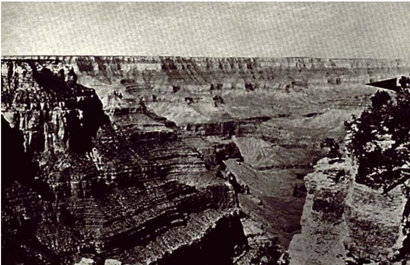
FIGURE 5. View of the Grand Canyon of the Colorado from the North Rim in Arizona. The arrow points to an assumed 100 Ma depositional gap in the layers.

In eastern Utah one can view the dramatic erosion caused by the Colorado River at Dead Horse Point. The locality received its name because a number of wild horses died there before the turn of the century. The