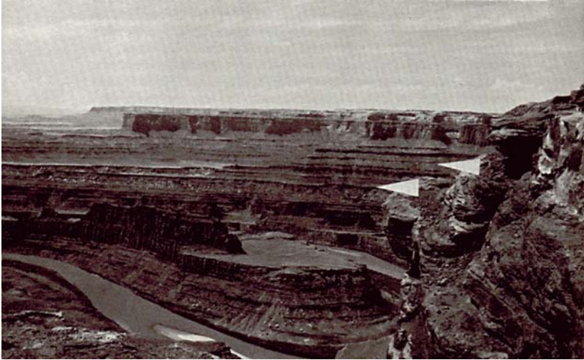
FIGURE 6. Valley of the Colorado River from Dead Horse Point, Utah. The top arrow points to an assumed 10 Ma depositional gap. The lower arrow points to a 20 Ma gap. Note the striking contrast between the flat depositional patterns of the layers at these 10 and 20 Ma hiatuses and the irregular erosion of the canyon by the Colorado River.

contrast between the effects of erosion forming the canyon and the parallel deposition of the layers is again striking (Figure 6). Within these layers are several assumed gaps. The lower arrow (right side) points to about 20 Ma (Ochoa-Guadalupe) assumed to be missing; the upper arrow (left side) points to about 10 Ma (Middle Triassic) of missing layers; yet, the contacts are very flat. This latter gap covers about 250,000 km 2 in the southwestern United States and can be seen at many localities where present erosion has exposed it. These two gaps are also illustrated in Figure 3 and lie respectively just below and above the Moenkopi Formation in the Triassic.