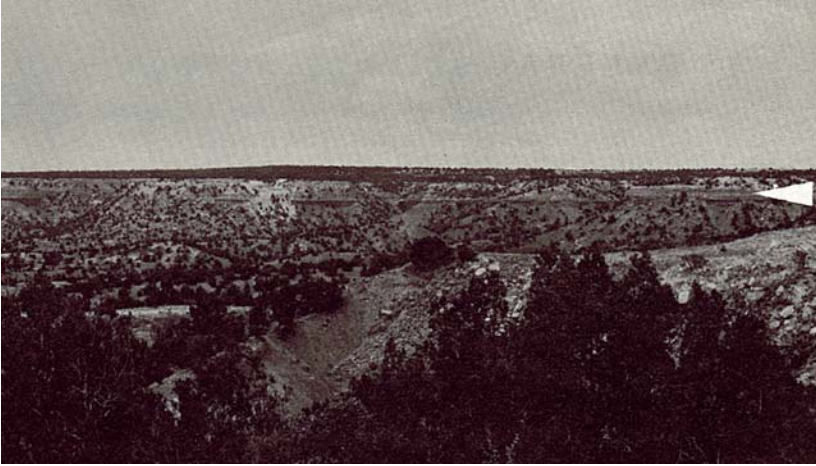
FIGURE 2. View of cliff south of Tucumcari, New Mexico. The same 200 Ma gap shown in Figure 1 is indicated by the arrow.

To the north the assumed gap decreases gradually as layers younger than the Trujillo and Chinle underlie the Ogallala.