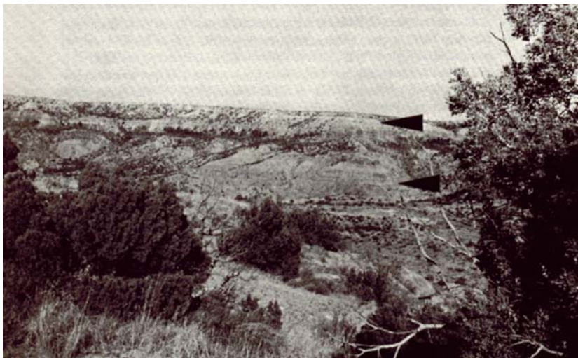
FIGURE 1. View of Palo Duro Canyon in northern Texas. The upper arrow points to an assumed 200 Ma gap in the sequence of sediment deposition. The lower arrow points to a 16 Ma gap.

Approximately 150 km to the west (Figure 2), south of the town of Tucumcari, New Mexico, the same assumed 200 Ma gap is found. The arrow in Figure 2 points to the contact between the Triassic Chinle Formation and the Pliocene Ogallala above. Three-hundred km further south near the town of Big Springs, Texas, the same relation can be seen.