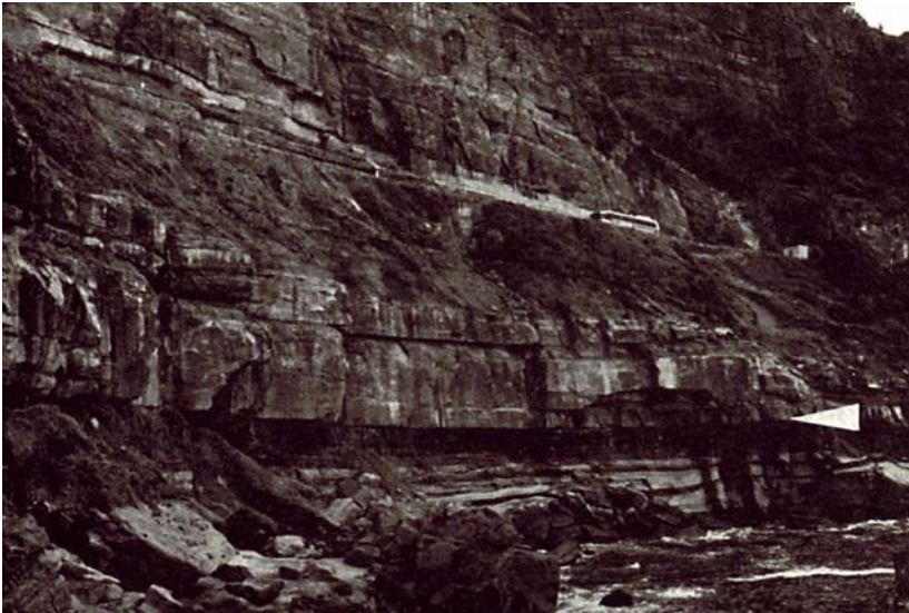
FIGURE 7. East coast of Australia in New South Wales. The arrow points to an assumed 5 Ma gap above the coal layer.

A puzzling characteristic of the erathem boundaries and of many other major biostratigraphic boundaries [boundaries