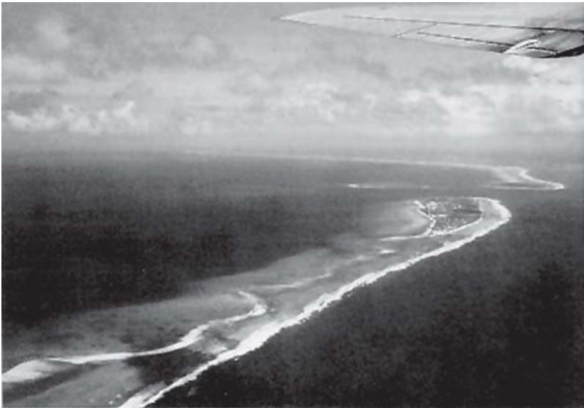
FIGURE 1. Portion of Enewetak Atoll, Marshall Island. To the right of center is Perry Islet. It is the largest islet visible in the picture and has a length of 2.3 km. The shallow atoll lagoon is to the left of the reef while the deep ocean is to the right.