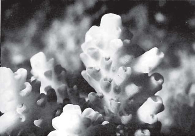
FIGURE 2. Closeup view of part of a coral tip of Acropora formosa from the lagoon of Enewetak Atoll. Each one of the “cups” on the tip harbors a single coral organism. The tip is about 25 mm long.

The question of the rate of coral reef growth is of considerable interest not only because reefs are incipient navigational hazards, but also because of the time required to build these large structures. A number of unsolved questions related to slow rates of subsidence or sea level rise and rapid rates needed to drown a reef (e.g., Schlager 1979) are of considerable academic interest. Some also wonder if the few thousand years proposed for life on earth in a biblical context can account for the growth of these huge structures. The Great Barrier Reef of Australia does not appear to pose a problem here. While it is over 2000 km long and up to 320 km offshore, drilling operations down through this structure have run into quartz sand (a non-reef type of sediment) at less than 200 meters (Stoddart 1969), indicating that it is a very shallow structure that does not necessarily require a vast amount of time for development. On the other hand, drilling operations on Enewetak (Eniwetok) Atoll (Figure 1) in the Western Pacific have gone through 1405 m of apparent reef material before reaching a basalt rock base (Ladd & Schlanger 1960). The rates of growth assumed by most investigators would dictate that at least scores of thousands of years would be required to grow a reef this thick. We shall evaluate the basis for these rates but will first consider a few of the peculiarities of the organisms involved.