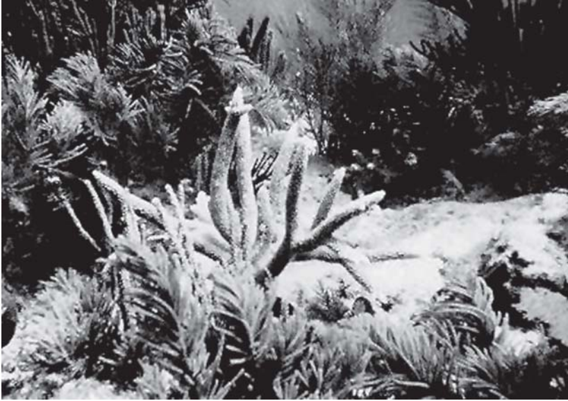
FIGURE 4. Isolated colony of Acropora cervicornis near the Florida Keys. This species has been reported to grow as fast as 260 mm/year. The colony is about 40 cm high. A large number of soft coral surround this colony.

point out that the reef can act as a filter, trapping some of the suspended carbonate load from the seawater passing through. Apparently, sediments on or near the bottom of the ocean could also contribute to reef growth, since Lonsdale, Normark & Newman (1972) found that the net movement of sand along the sides of Horizon Guyot (a submerged flat-topped mountain reaching up 3 km from the Pacific Ocean floor) is upslope , being moved up by tidal currents. Under similar circumstances, some of the rapidly growing coral near the surface of a reef (Figure 3) would facilitate more rapid carbonate deposition by trapping sediments brought upslope along the reef. In this situation the live coral would not have to build the entire mass of the reef, but only build a framework to hold the sediments.