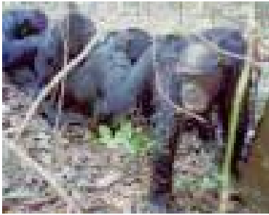
Chimps in Gombe, Tanzania.