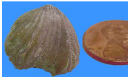
Fossil brachiopod.

Summary: Fossil articulate brachiopods are common, extending down to lower Cambrian strata. While brachiopod valves may be preserved, soft tissue preservation is extremely unusual. In this remarkable Silurian specimen some