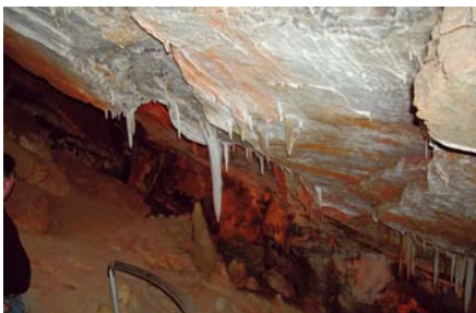
Stalactite in Glenwood Caverns, near Glenwood Springs, Colorado.